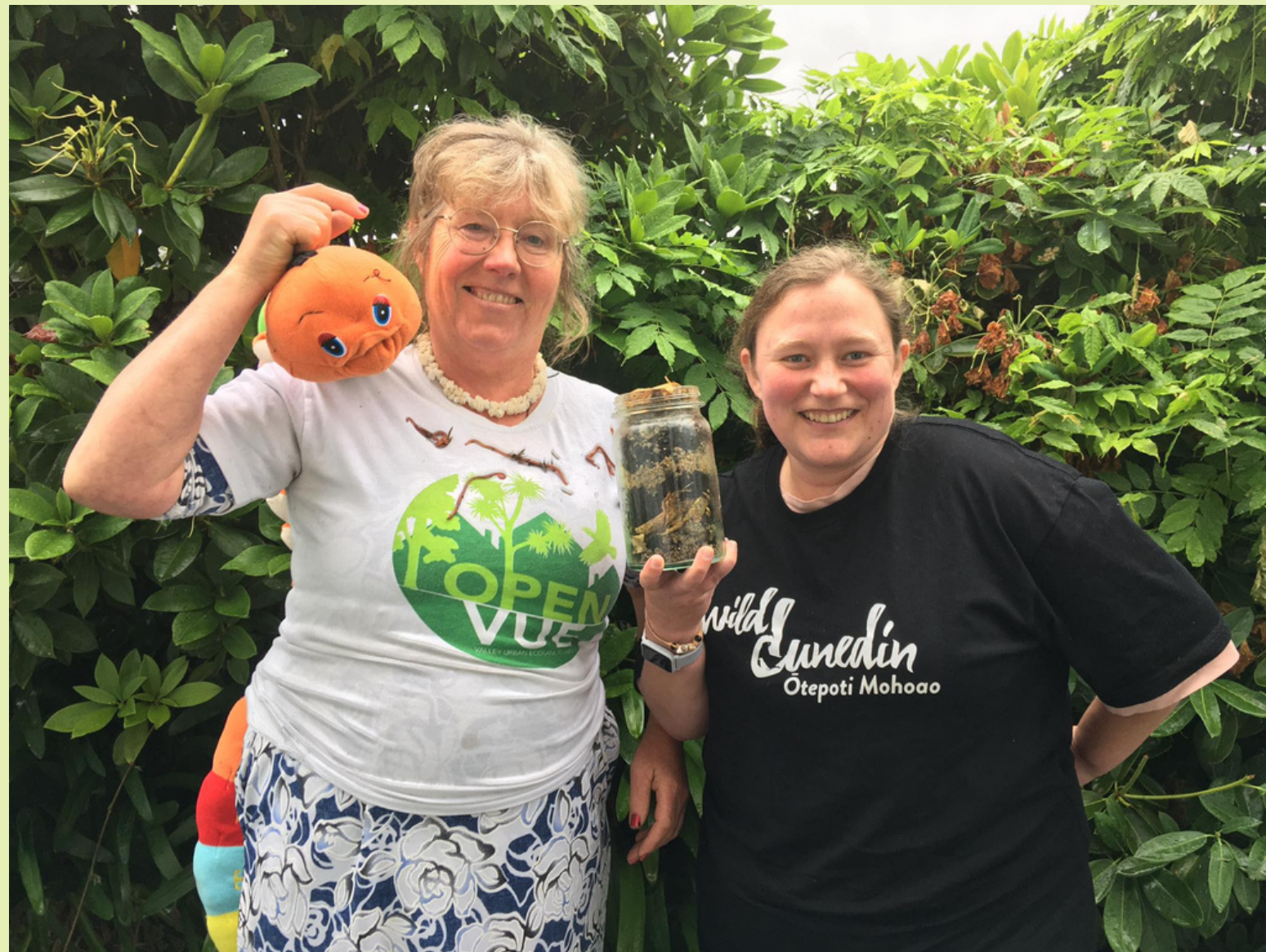
Community members and Wild Dunedin