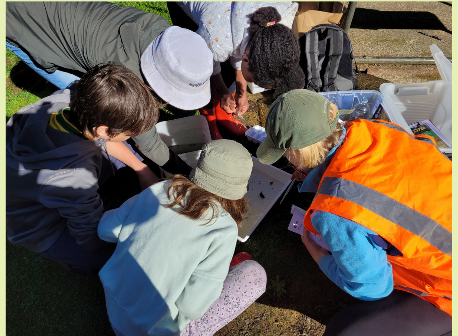
Community Classroom workshop