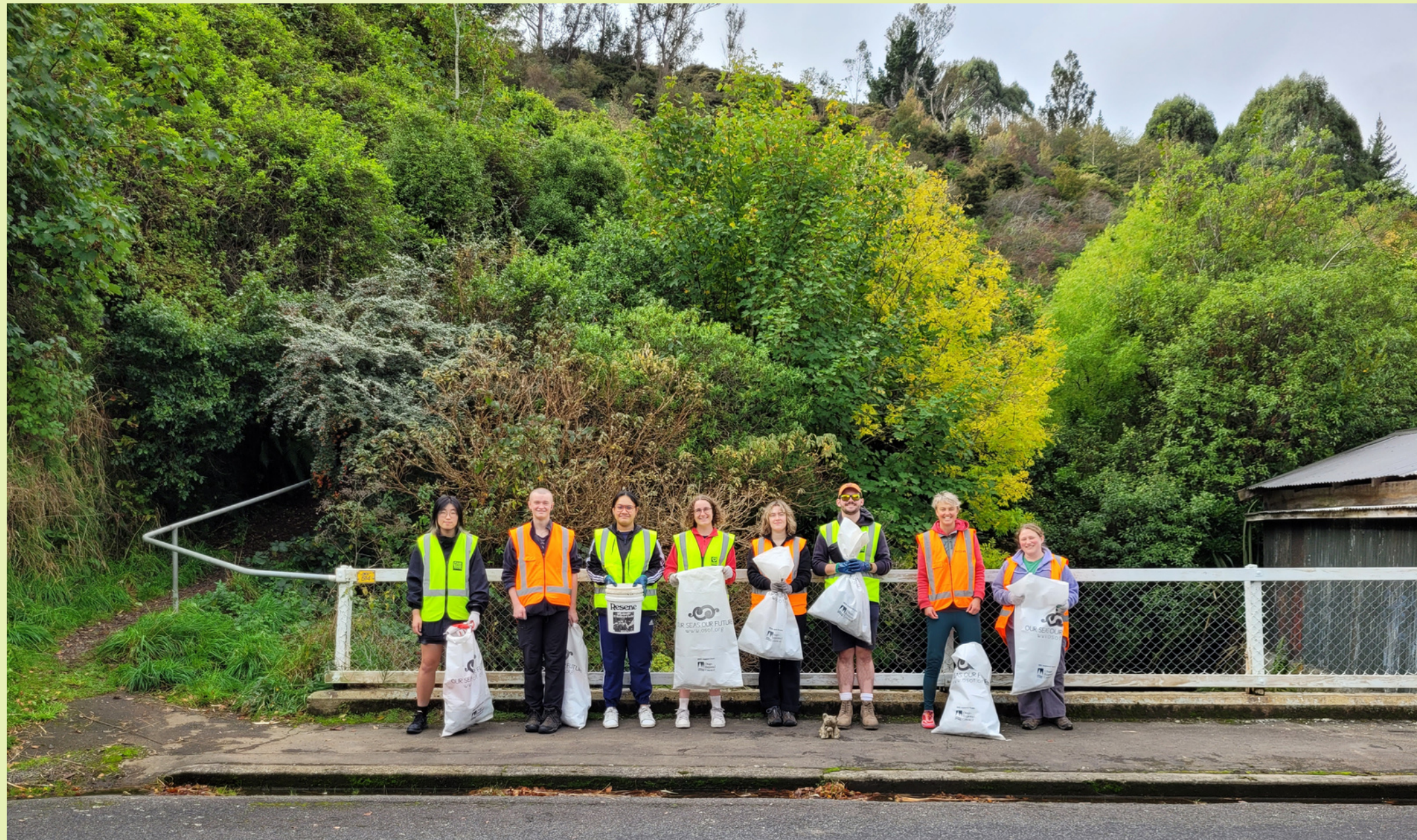
Carrington College Easter Clean up

to help us build an inclusive, connected, thriving community