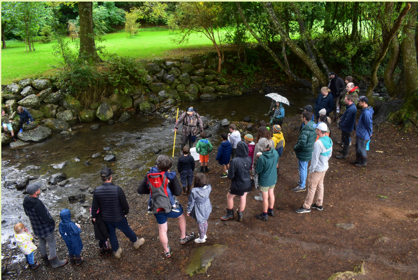
Fish and Game Electrofishing demo