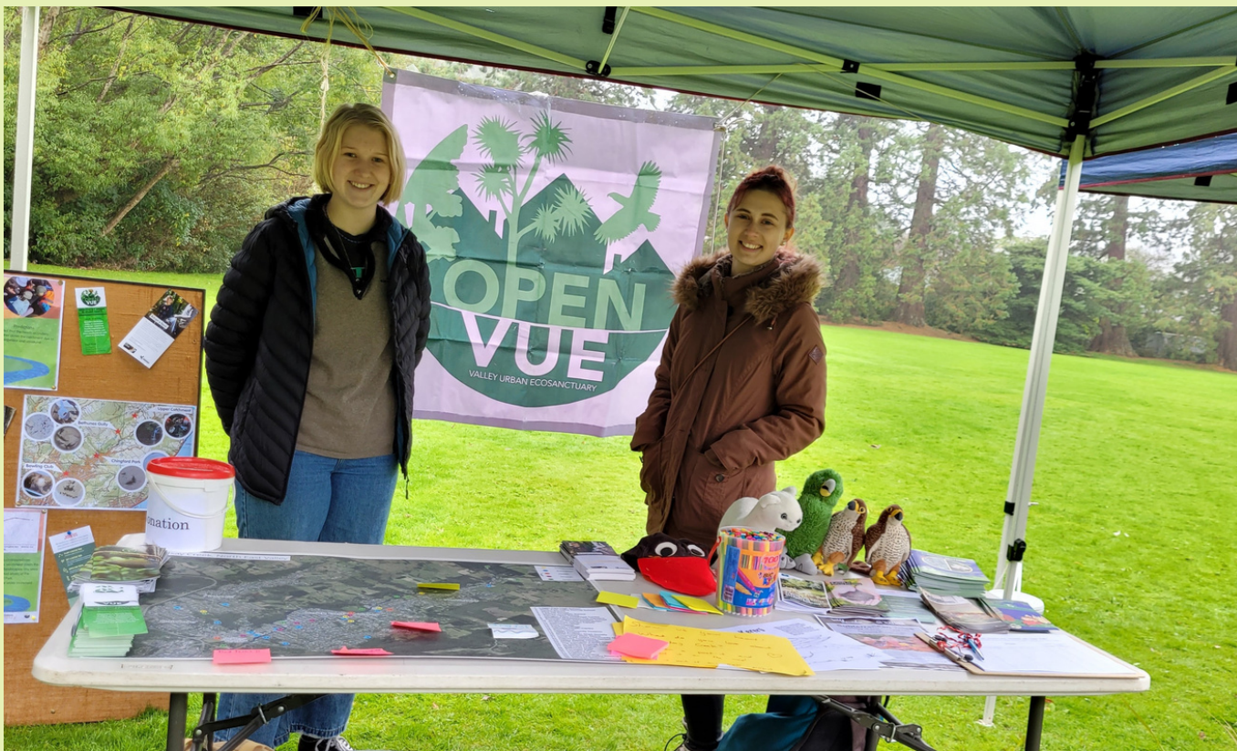
Open VUE stall