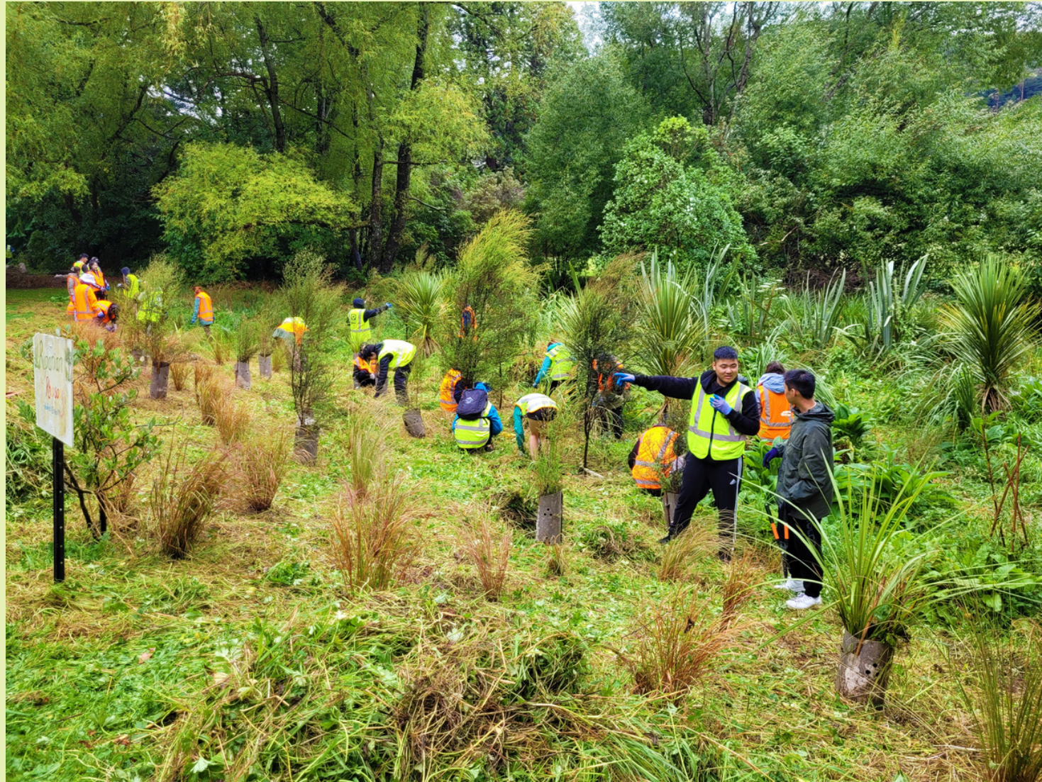
Riparian Rhapsody (O'week)