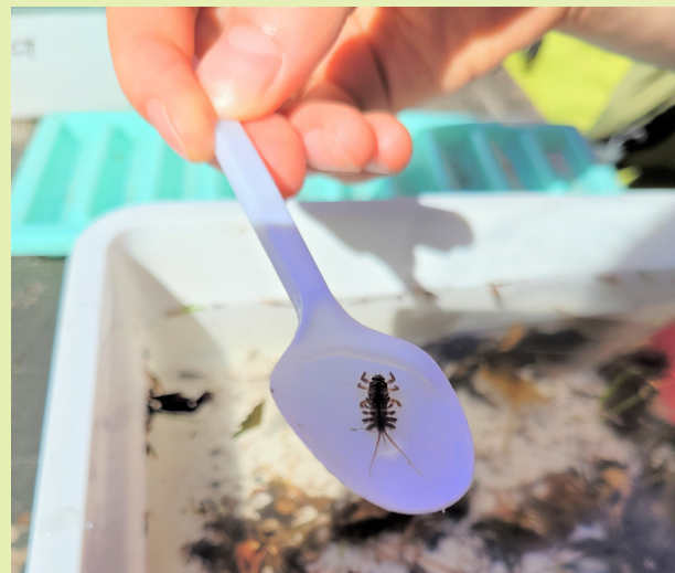
Spiny Gilled Mayfly