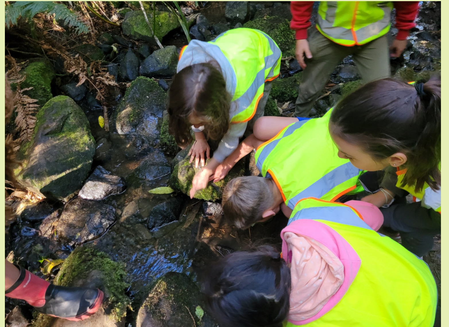
Ōpoho school hands on activities