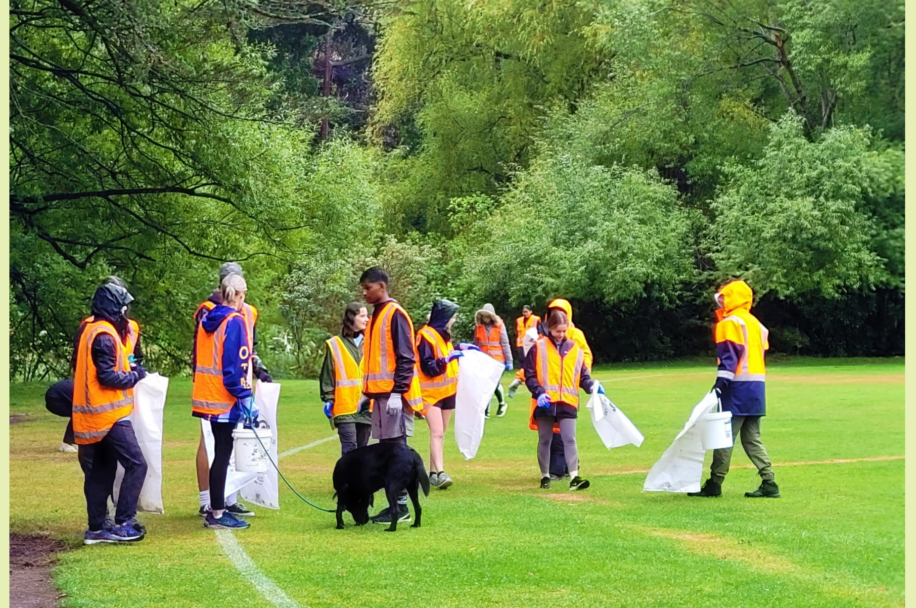
St Margarets college